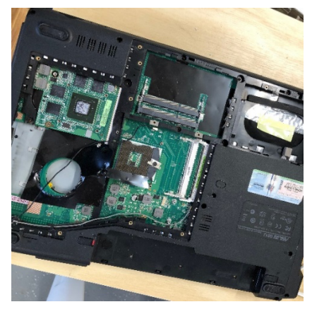
Figure 2: A broken laptop could be used to discuss input and output or to discuss or label internal components.

Giving students opportunities to understand how digital systems function can take a range of forms such as discussing the purpose of the system components with an expert, reading a book or watching a video that explains the way a digital system works.