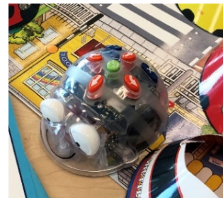
Figure 3: How could you use a Bee-Bot to explain input and output or other aspects of a digital system?