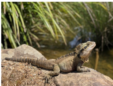
Figure 5: Australian water dragon