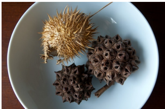
Figure 2: Seed pods