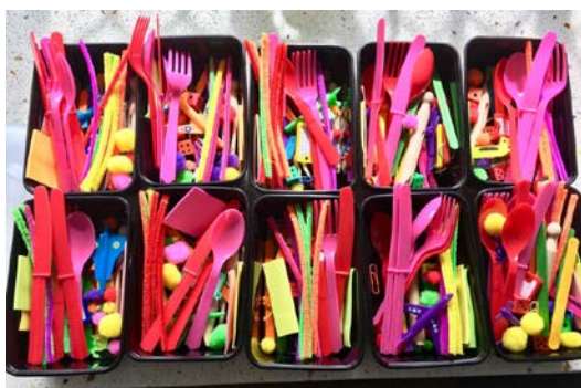
Figure 1: An example of 'data boxes' that can be used for classifying, grouping and sorting activities