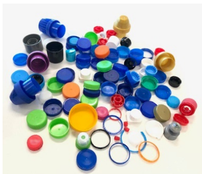
Figure 4: Plastic lids and rings