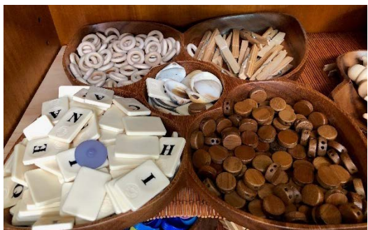
Figure 3: Loose parts/classroom resources can be sorted and grouped in many ways such as by material.

https://www.flickr.com/photos/thrusty/4874194441/