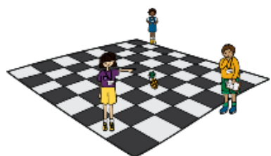
Figure 3: An illustration of the CS Unplugged kidbot algorithm activity.

Algorithms are a key concept in Digital Technologies and fundamental in computational thinking (poster available – see Useful links.) They help us follow, describe and represent a sequence of steps and decisions needed to solve simple problems (ACTDIP004). We use them every day, often in the form of procedures that can be easily repeated. Getting ready for school in the morning using a routine (Figure 1), the process of moving into or out of class and task instructions given by a teacher are all algorithms.