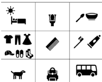
Figure 1: An example of a morning routine chart, made using symbols. Routines can be used to teach very young students about the importance of order and sequencing.