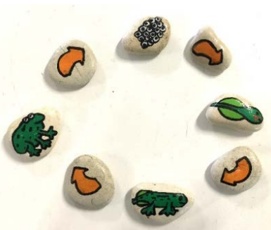
Figure 2: A visual algorithm that demonstrates the life cycle of a frog, created using hand-painted rocks