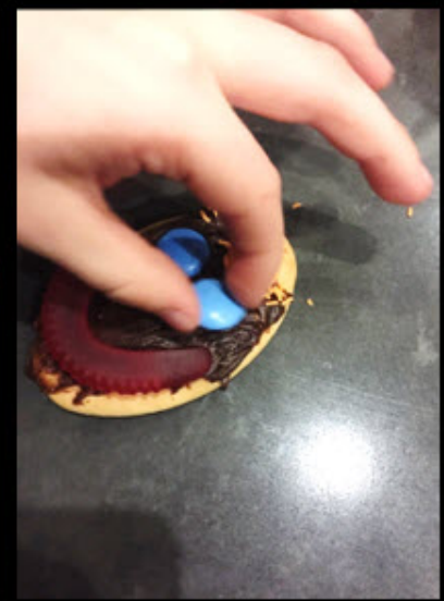
Figure 5: Smiley face biscuit visual algorithm cards