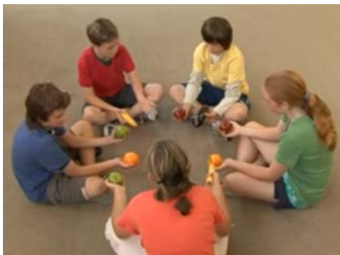
Figure 2: Students play the orange game to explore how a router works.