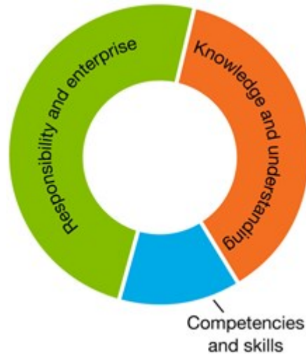
Approximate proportion of the dimensions addressed by Ethical Understanding

The Ethical Understanding capability has a role in developing consumer and financial literacy in young people. This capability equips students to take account of ethical considerations in consumer and financial contexts such as human rights and environmental issues related to the production and consumption of goods and services. Ethical Understanding contributes to the development of the dimensions of consumer and financial literacy as shown in the diagram below.