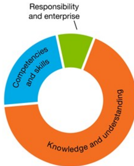
Approximate proportion of the dimensions addressed in Work Studies

The Australian Curriculum: Work Studies has a unique role in developing consumer and financial literacy in young people. Work Studies prepares students with the self-knowledge, contemporary work skills and entrepreneurial behaviours that will enable them to participate in the rapidly changing world of work. Work Studies supports the development of the dimensions of consumer and financial literacy as shown in the diagram below.