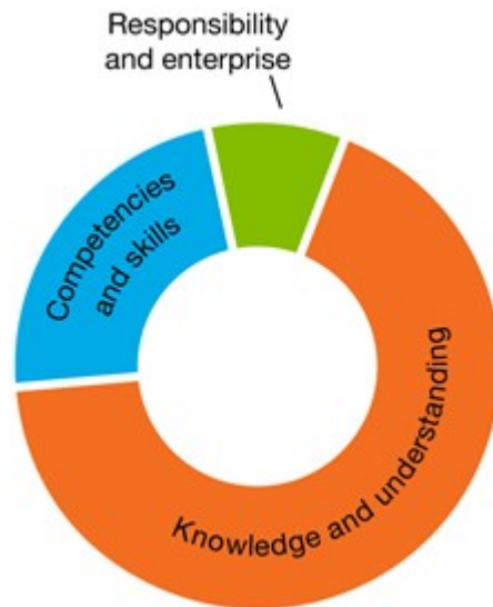
Approximate proportion of the dimensions addressed in Work Studies

The Australian Curriculum: Work Studies has a unique role in developing consumer and financial literacy in young people. Work Studies prepares students with the self-knowledge, contemporary work skills and entrepreneurial behaviours that will enable them to participate in the rapidly changing world of work. Work Studies supports the development of the dimensions of consumer and financial literacy as shown in the diagram below.