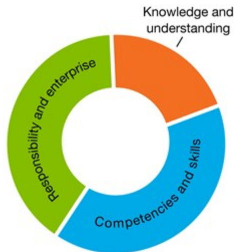
Approximate proportion of the dimensions addressed in Health and Physical Education

The Australian Curriculum: Health and Physical Education (HPE) can play an important role in developing consumer and financial literacy in young people. HPE supports the development of the dimensions of consumer and financial literacy as shown in the diagram below.