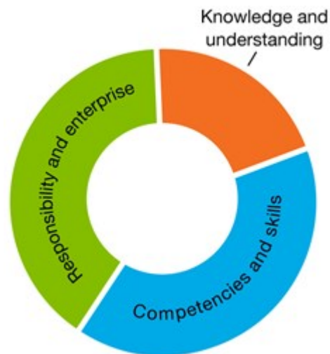
Approximate proportion of the dimensions addressed in Health and Physical Education

The Australian Curriculum: Health and Physical Education (HPE) can play an important role in developing consumer and financial literacy in young people. HPE supports the development of the dimensions of consumer and financial literacy as shown in the diagram below.