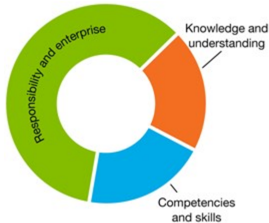
Approximate proportion of the dimensions addressed in Digital Technologies

The Australian Curriculum: Technologies has a significant role in developing consumer and financial literacy in young people. The Digital Technologies subject supports the development of the dimensions of consumer and financial literacy as shown in the diagram below.