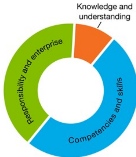
Approximate proportion of dimensions addressed in 7-10 Civics and Citizenship

The Australian Curriculum: Civics and Citizenship is uniquely positioned to develop consumer and financial literacy in young people. The Civics and Citizenship curriculum supports the development of the dimensions of consumer and financial literacy as shown in the diagram below.